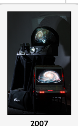
First dual mirror projection system